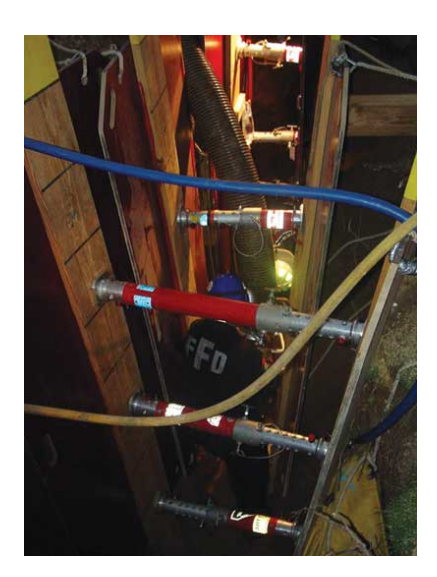
(5) The rescuers remove soil from the victim with the rescue vacuum and the air knife

Awareness-level technical rescue training is essential. With proper awareness training, first-arriving units, without entering the trench, can properly assess the scene while using on-scene resources to make the scene safe before a technical rescue team arrives. Through a partnership between the Indiana Department of Homeland Security and the Indiana Fire Chief's Association, the state released a global technical awareness training program. Covering all facets of technical rescue, this firefighter safety initiative was distributed to every fire department in the state at no cost.