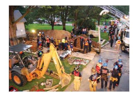
(3) HCTRT members operate the rescue vacuum system.

Two additional panel sets were installed to gain working room. Since a section of the lip and the wall were missing, a buttress system was built to create a contact point behind one of the panels to ensure positive contact with the shoring system. The buttress was used in lieu of traditional "outside wales," since the width of the trench was limited. Two 24-inch low-pressure air bags were used to take up void spaces between two separate panels and maintain positive contact in the shoring system.