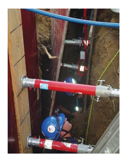
(2) A rescue medic starts

Note: This should be considered a standard operating procedure for trench rescue operations, even without access to the rescue vacuum system, because the open-butt vacuum hoses can still be used to remove vast amounts of soil much faster than by hand in most cases, and they can also be used to remove water in case of rain or a pipe failure. In fact, the Los Angeles County (CA) Fire Department typically requests three hydrovac trucks (one for primary operation, one set up to continue vacuuming when the first vacuum fills with dirt and must be unloaded, and the third in case of mechanical breakdown of either of the other two).